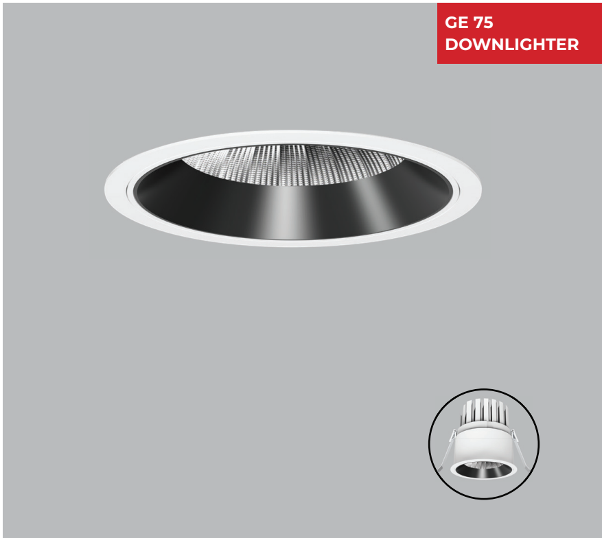
GE 75 DOWNLIGHTER

GE 75 Recessed COB Spot light Downlighter is Fixed led Downlight made up of die cast aluminium housing, Finned heat sink to dissipate heat, increase performance and with premium powder coated finish.